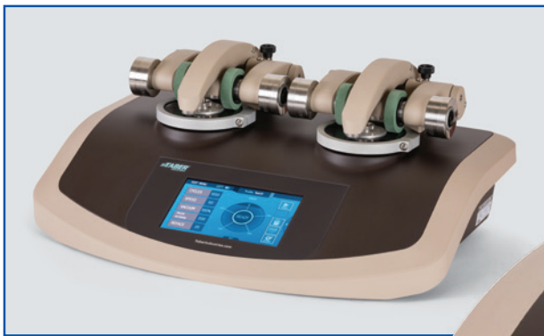
MODEL 1750 DUAL PLATFORM ABRASER