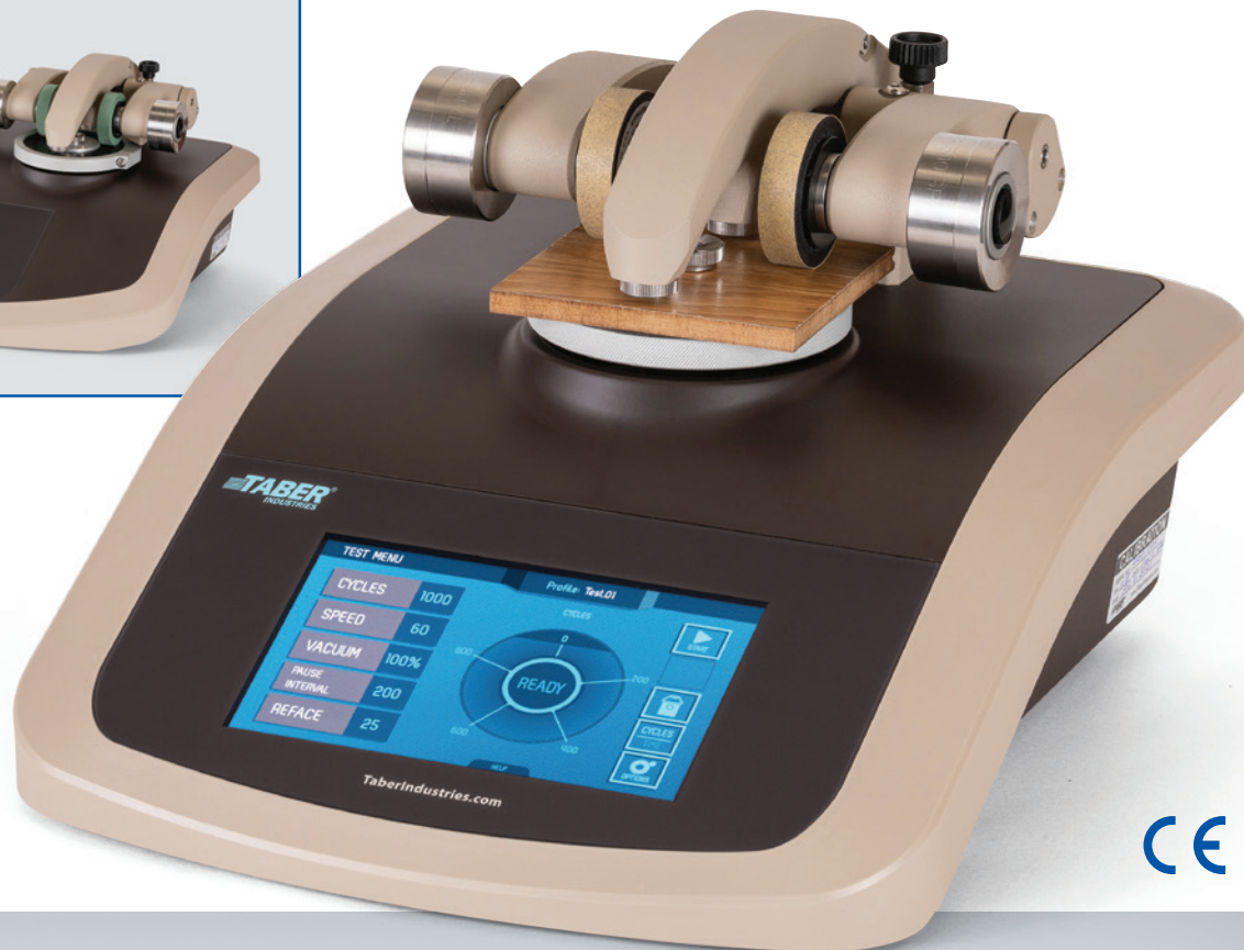
MODEL 1700 SINGLE PLATFORM ABRASER