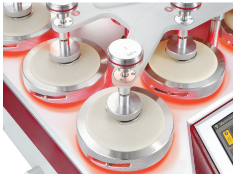
Fabric Abrasion: flat woven, knitted and nonwoven fabric

The Martindale can be used for Fabric Abrasion, Fabric Pilling, Sock Abrasion, Leather Abrasion, Edge Abrasion, Testing Floor Coverings, Toothbrush Testings and Other Specialized Testings including Custom Configurations.