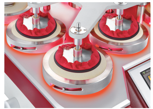
Fabric Pilling: woven and knitted fabric