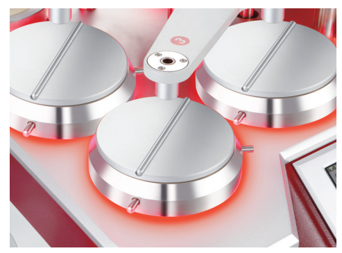
Edge Abrasion: shirt collars, cuffs, backpack straps and related items