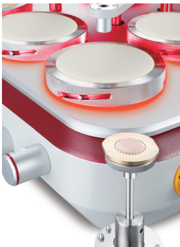
Sock Abrasion: knitted socks, tights and hosiery